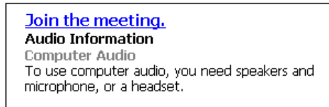
Figure 1. Link for joining the meeting

In the e-mail invitation or the calendar item, click the Join the meeting link, as shown in Figure 1. Microsoft Office Live Meeting automatically opens and joins you to the meeting. If you do not have the client installed on your computer, the invitation will contain instructions on how to install it.